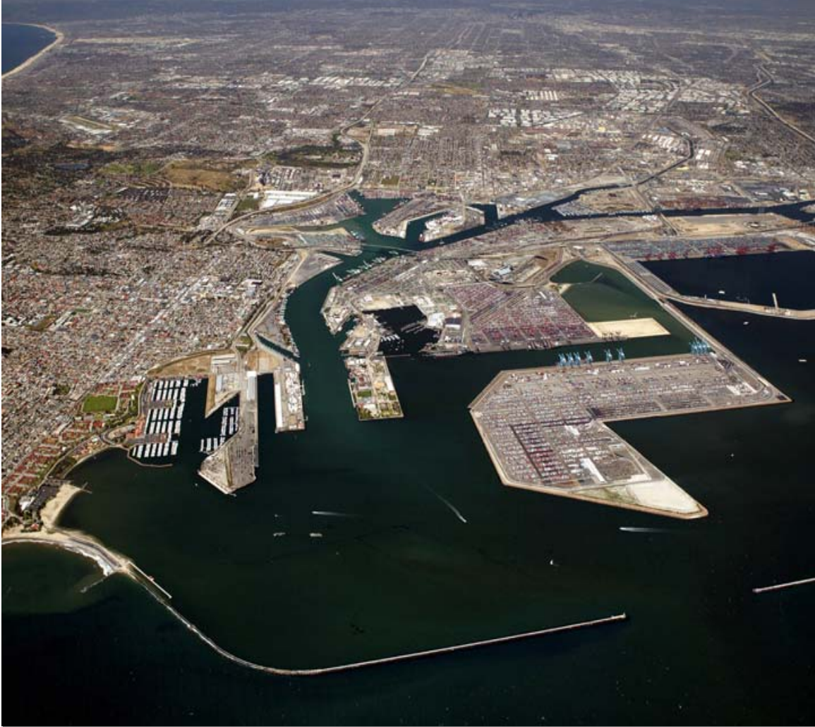
Port of Los Angeles Los Angeles, California

Project Description: YCG is part of a consulting team assisting the Port of Los Angeles in the redevelopment of its waterfront commercial properties. The project will encompass several hundred thousand square feet of regional and visitor serving uses.